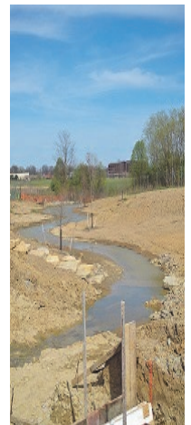
Summit Park creek restoration

June 22 nd 1-2:30pm: Native Plants in the home garden, and battling honeysuckle and other invasive plants June 26 th 7:00-8:30pm: Native Plants in the home garden, and battling honeysuckle and other invasive plants July 8 th 10:30-12:00pm: Why native plants; Battling invasive plants; and rain gardens 101 July 13 th 1:00-2:30pm; Putting rainwater to good use; bioswales, rain gardens, and rain barrels July 27 th 7:00-8:30pm: Putting rainwater to good use; bioswales, rain gardens, and rain barrels