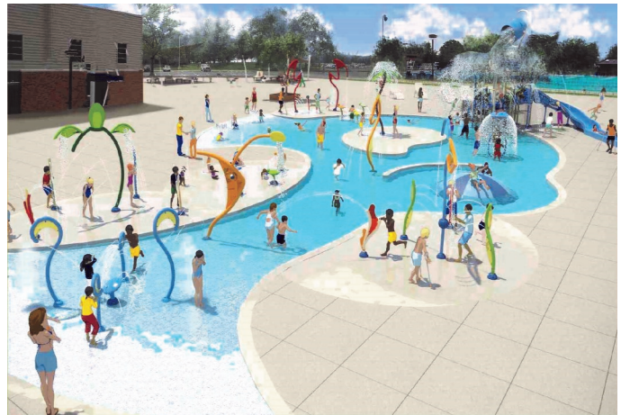
Family Wading Pool rendering