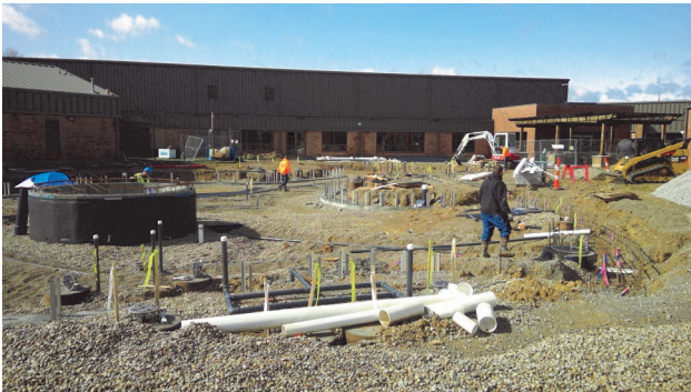
Family Wading Pool under construction at the Blue Ash Recreation Center

The Family Wading Pool is expected to open mid-summer!