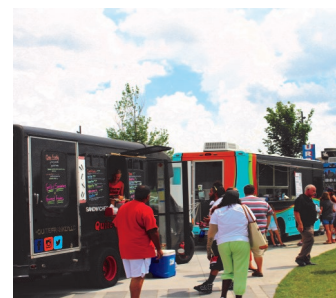
2016 CFTA Street Food Festival at Summit Park

Tens of thousands of people are expected to head to Summit Park for Red, White & Blue Ash and Taste-Blue Ash Food and Music Festival, which is now two days long. The events will include performances from national artists including REO Speedwagon, Loverboy, and Big & Rich with Cowboy Troy.