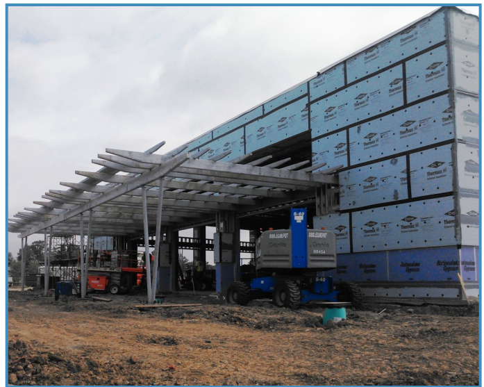
Left: Summit Park's new Dog Park; Right: The Community Building

Building B, which is a mirror image of the Community Building, is opposite of the Glass Canopy and will house a number of restaurants in the future. Building B is scheduled to begin in August and will be completed in early 2016.