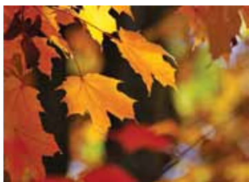
SEPTEMBER Fall Beauty