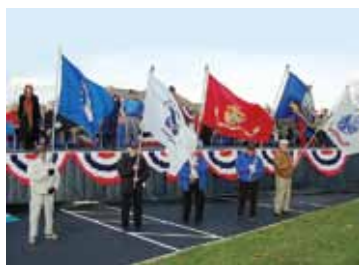
NOVEMBER Veterans Day