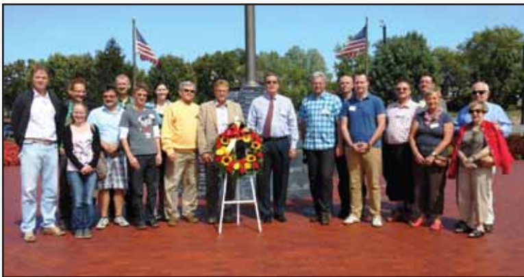
Delegates honor veterans with the placement of a wreath at the Blue Ash Bicentennial Veterans Memorial Park.

Blue Ash is expected to send a delegation to Ilmenau in May 2013.