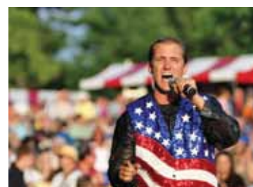
AUGUST They're Coming to America