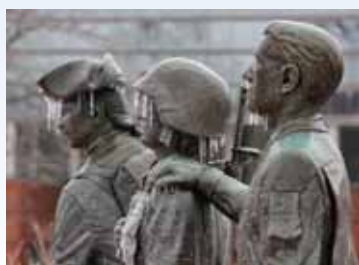
FEBRUARY Beauty in Ice