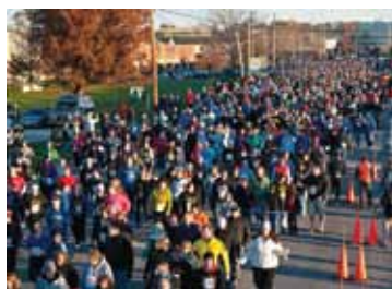
OCTOBER Race for Hunger