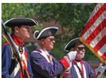
MAY Patriotism on Display