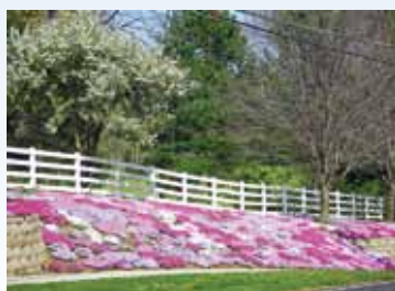
MARCH Mohler Road Flower