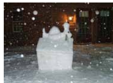
DECEMBER Snow Snoopy