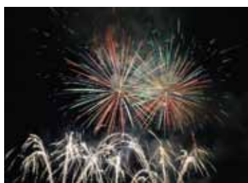
JULY Red, White, Kaboom