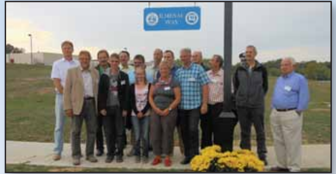
The entire Ilmenau delegation proudly poses at Ilmenau Way, the City’s newest street which connects Osborne Blvd and Reed Hartman Highway.