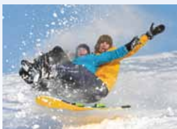
JANUARY Downhill Thrills

Take your camera to big events like Red, White and Blue Ash and Taste of Blue Ash, but also take photos of your children and grandchildren playing in one of our great parks. Snap pictures of hidden landmarks and well known hot spots. If it's Blue Ash, we want it photographed. In a future newsletter, the City will announce how to submit the photos. In the meantime, start snapping!