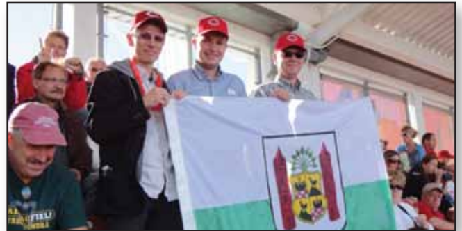
Delegates pose at the Reds NL Central Division ‘Climb’ Game against the Dodgers.