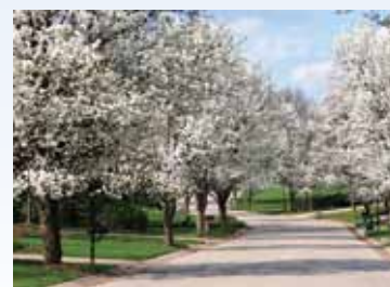
APRIL Sycamore Grove Lane