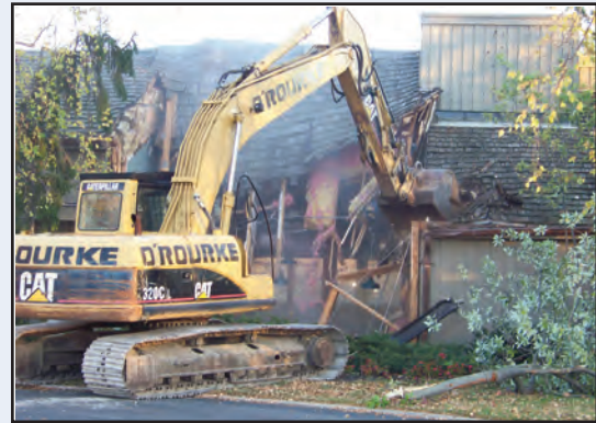
Demolition of the former wooden clubhouse began on November 1. Remember that the course will remain open throughout the construction period weather permitting.

The irrigation work should be completed in late May, and construction of the clubhouse is expected to be completed in early fall. A project component yet to be scheduled during 2011 is replacement of the golf cart paths. Check out BlueAsh.com for updates and for details associated with a dedication event to be held upon its completion.