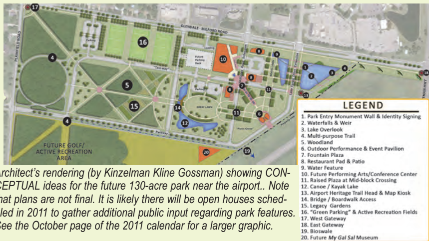
Architect's rendering (by Kinzelman Kline Gossman) showing CONCEPTUAL ideas for the future 130-acre park near the airport.. Note that plans are not final. It is likely there will be open houses scheduled in 2011 to gather additional public input regarding park features. See the October page of the 2011 calendar for a larger graphic.

The City looks forward to development of this wonderful future 130-acre park and believes it will be a source of pride for Blue Ash residents for generations to come.