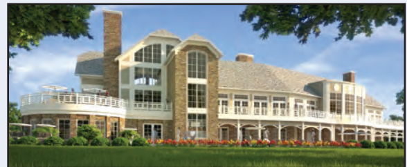
Architect's renderings of the new multi-functional golf clubhouse/banquet facility. Pictured top is the view from the front (Cooper Road), & pictured below is a view from the rear (golf course). Renderings by Steed Hammond Paul. See more information & renderings on the January page of the 2011 Community Calendar.

(Golf/Banquet facility article continued on Page 2.)