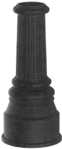
Troy decorative base