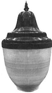
Ring of Fire light fixture