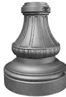
Americana decorative base