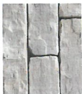
FOND DU LAC