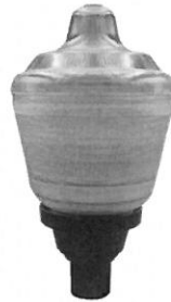
Woodward light fixture