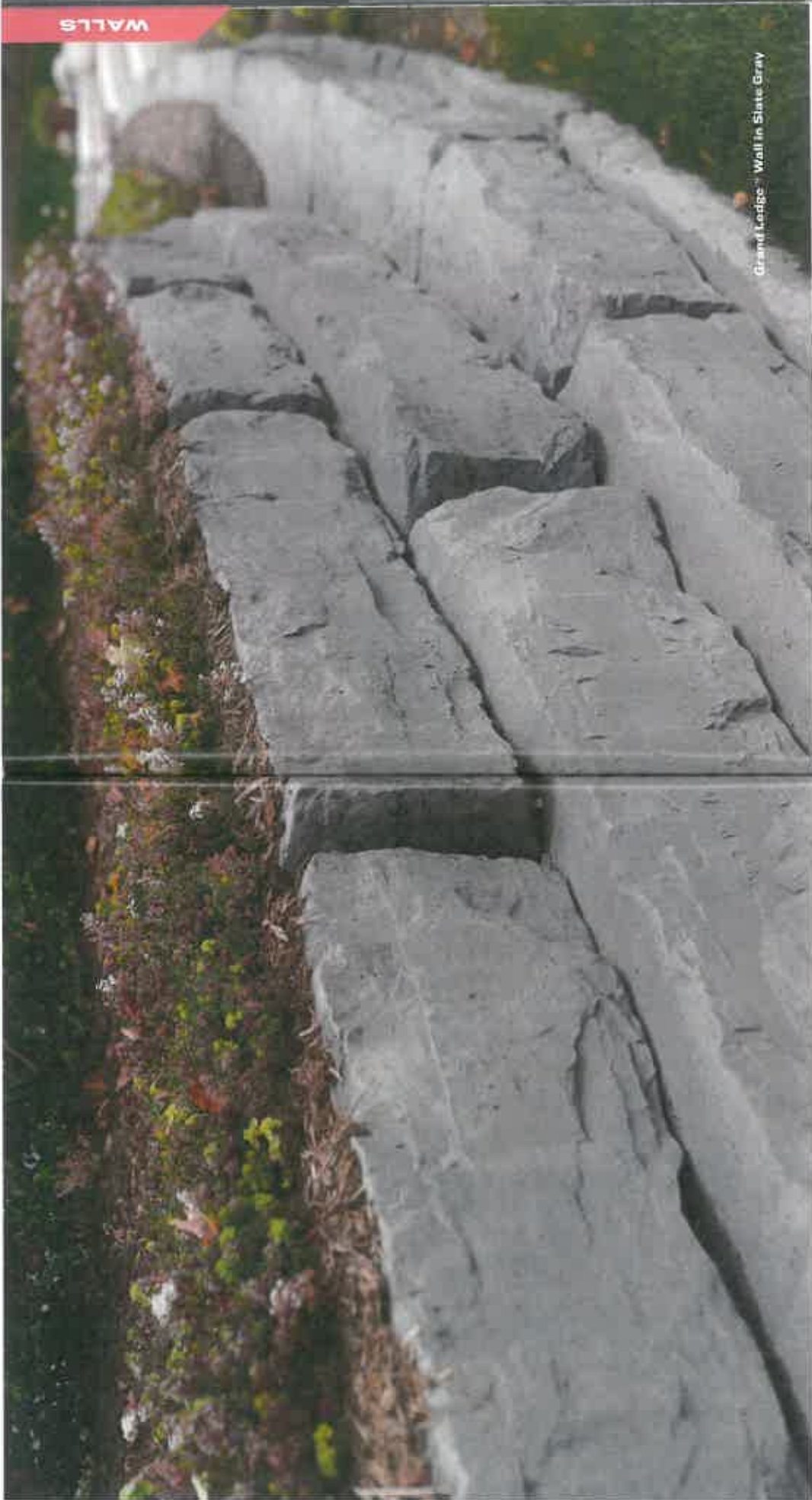
Grand Ledge™ Wall in Slate Gray